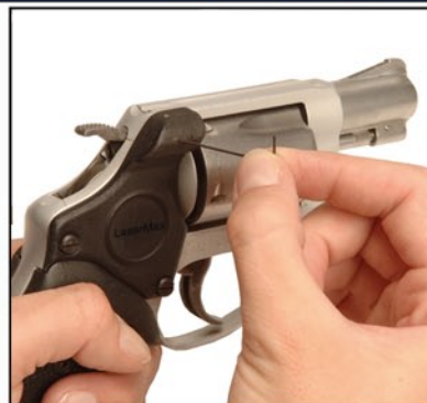
The hole at the side adjusts windage (horizontal alignment). A clockwise turn shifts laser right.

NOTE: When installing J-Max™ for the first time, a slight shift in alignment may be noticed after firing, due to settling. Recheck alignment after your first trip to the range. Readjust if necessary.