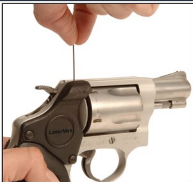
The hole at the top adjusts elevation (vertical alignment). A clockwise turn shifts laser up.

NOTE: When installing J-Max™ for the first time, a slight shift in alignment may be noticed after firing, due to settling. Recheck alignment after your first trip to the range. Readjust if necessary.